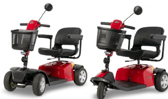
Rascal® Conquest is available in both 3 and 4-wheel models.