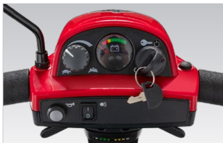
Intuitive controls include speed adjustment, battery meter, key switch, horn, headlight, and forward/reverse throttle.