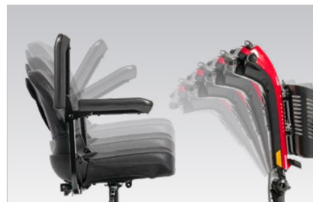
Maximize your comfort with flip-up armrests, adjustable tiller, and seat height adjustment.