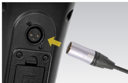
Recharging the Conquest is fast and easy with the charging port located conveniently in the center of the tiller.